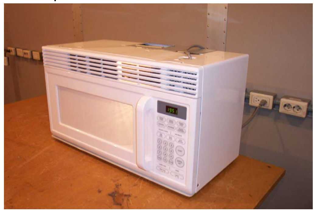
Daewoo Electronics Corporation. FCC ID:C5F7NF1GMO100N