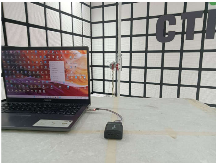
Radiated spurious emission Test Setup-2 (Above 1GHz)