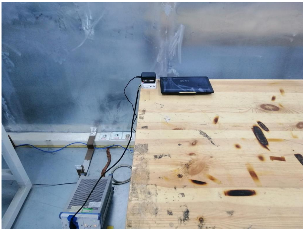
AC Conducted Emission of charge from power adapter mode