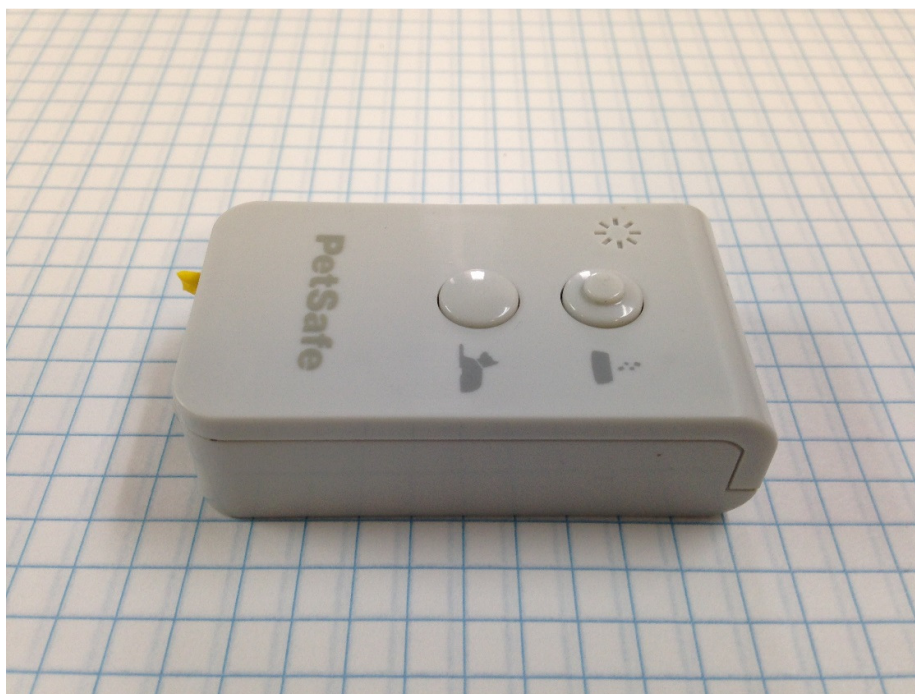
Figure 6. Side View 2

FCC Part 15 Certification/ RSS 210 KE3-3003698 2721A-3003698 22-0168 July 12, 2022 Radio Systems Corporation RFA-615