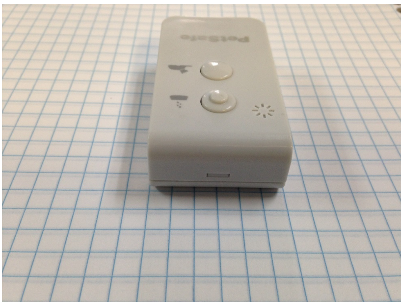
Figure 3. Top View

FCC Part 15 Certification/ RSS 210 KE3-3003698 2721A-3003698 22-0168 July 12, 2022 Radio Systems Corporation RFA-615