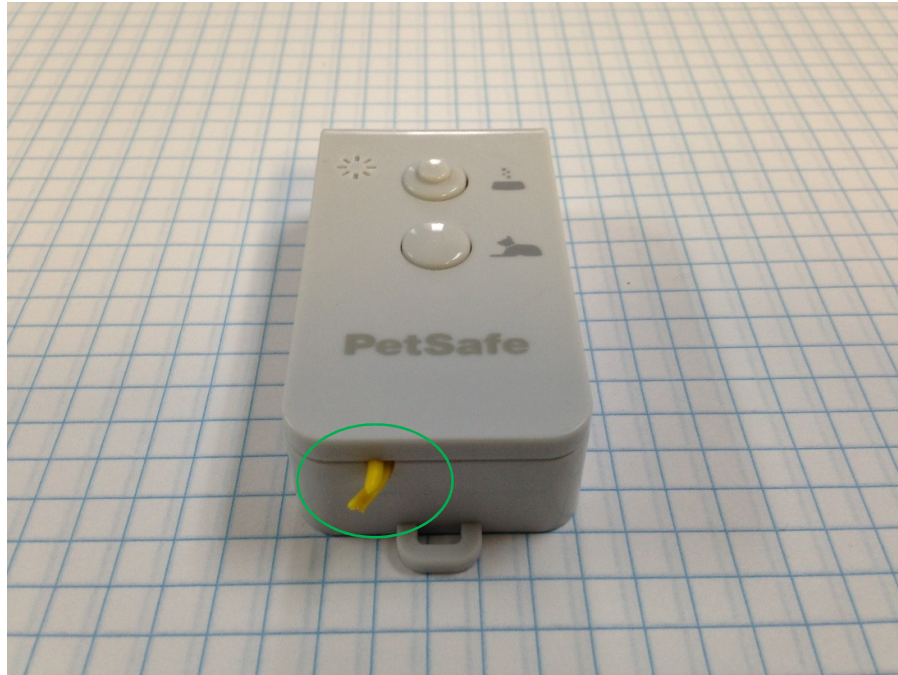
Figure 4. Bottom View

FCC Part 15 Certification/ RSS 210 KE3-3003698 2721A-3003698 22-0168 July 12, 2022 Radio Systems Corporation RFA-615