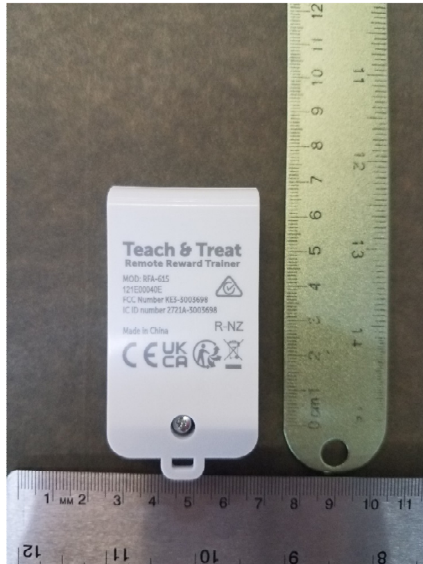
Figure 2. Back View

FCC Part 15 Certification/ RSS 210 KE3-3003698 2721A-3003698 22-0168 July 12, 2022 Radio Systems Corporation RFA-615