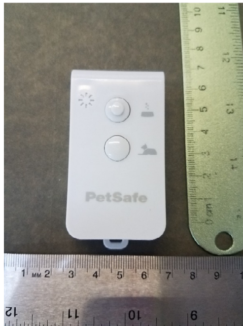
Figure 1. Front View