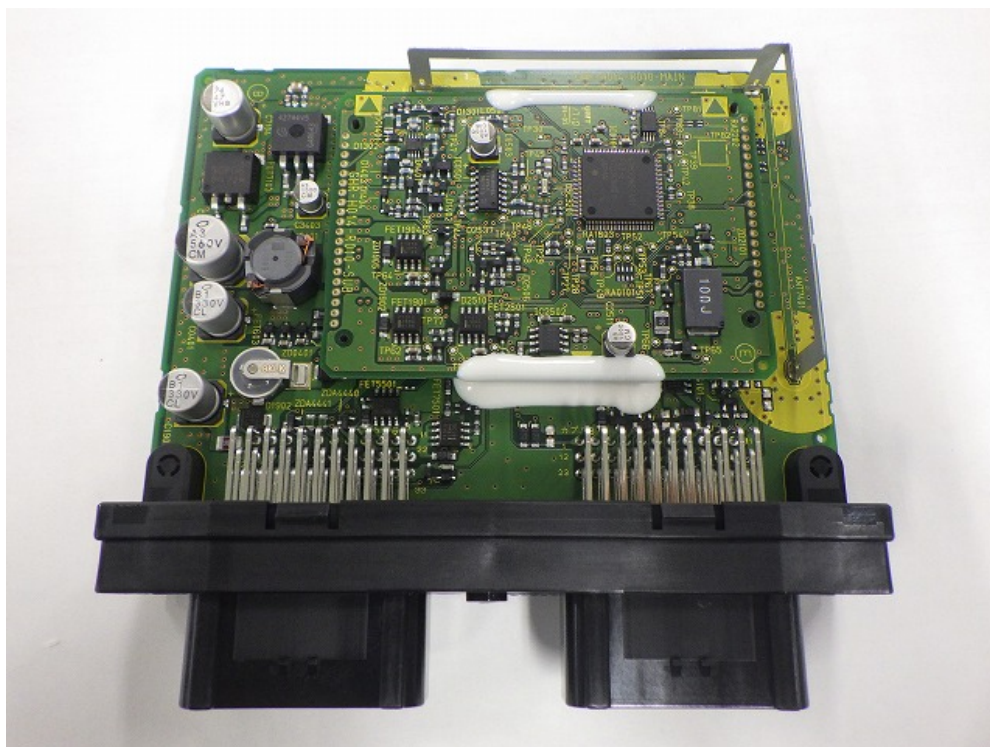
Figure 8.1 GHR-H014-R PCB assy (top view)