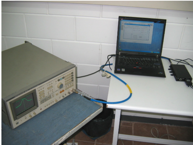
Photograph No.1 Output power, power density, conducted spurious emissions and the 6 dB occupied bandwidth measurement setup