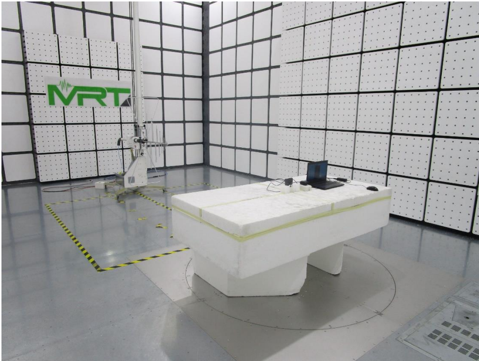
Description: Radiated Emission Test Setup for 1GHz~18GHz