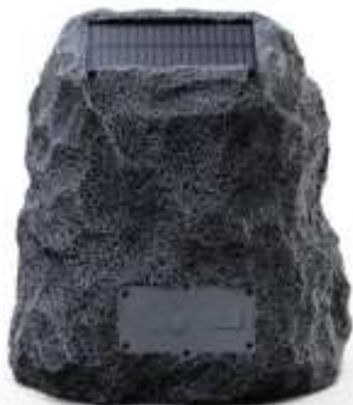
Imitation stone speakers