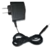
Wall Charger Adaptor