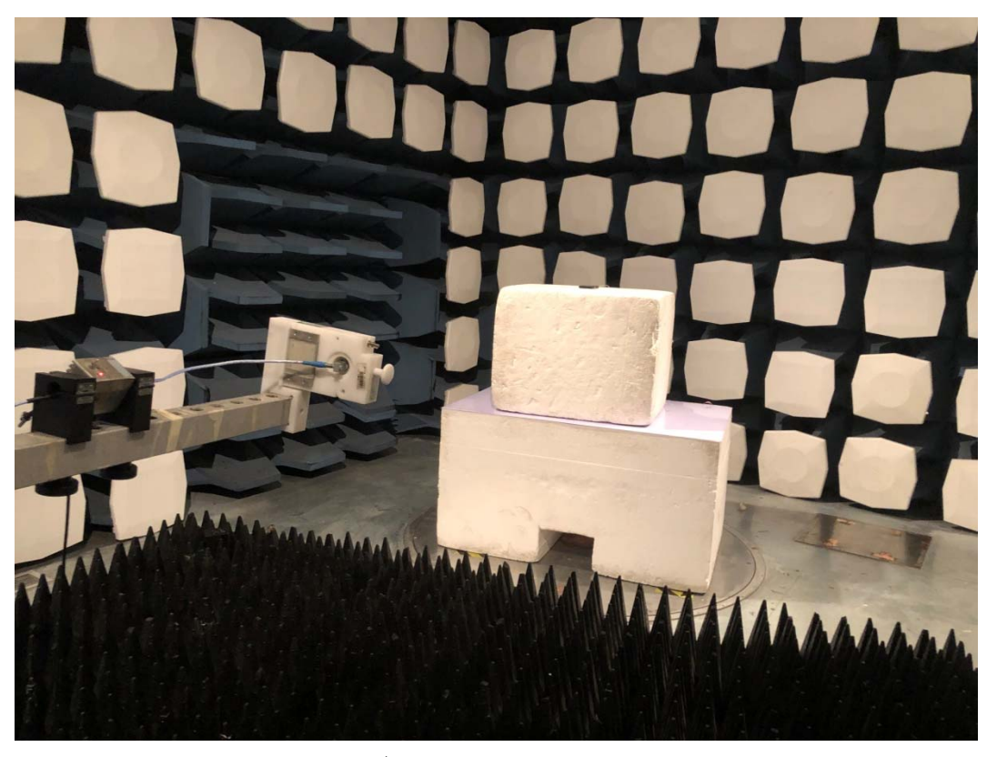
18GHz - 26.5GHz