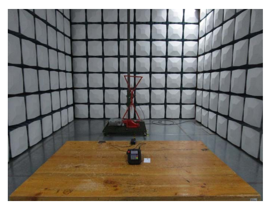
Radiated Emission - View (30 MHz-1GHz)