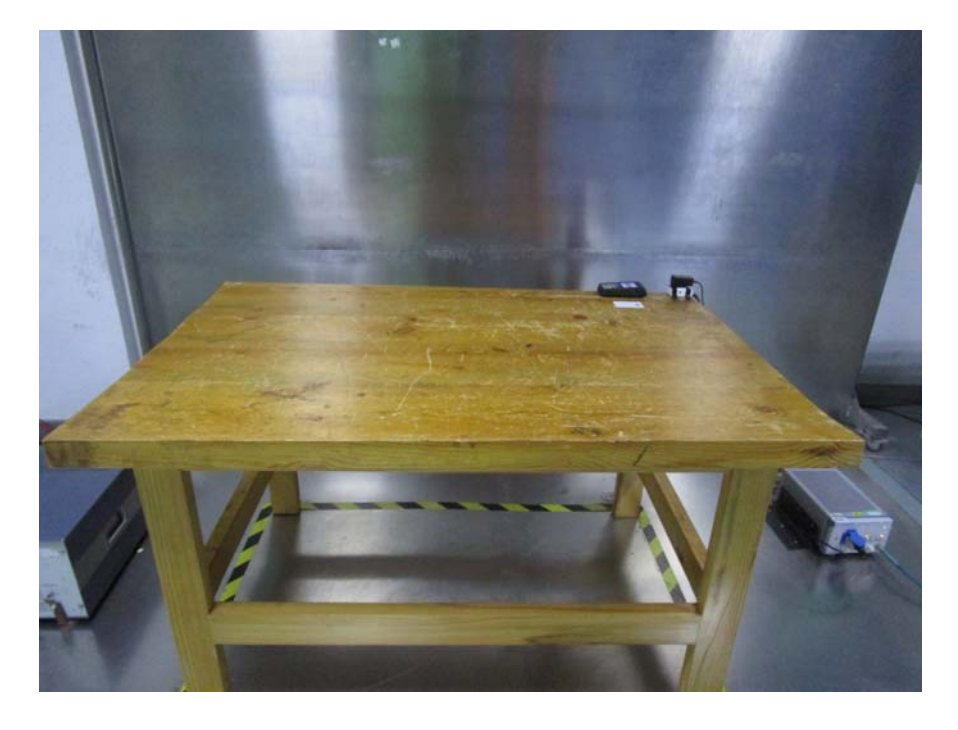
Conducted Emissions – Side View(Adapter#2)