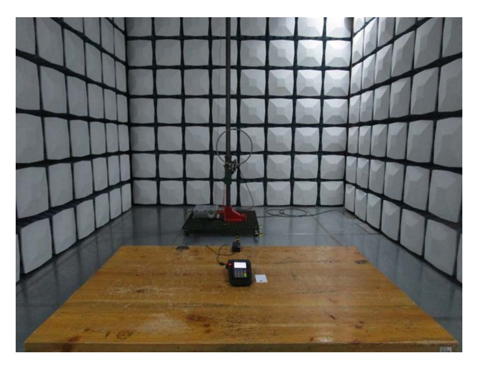
Radiated Emission - View (9 kHz-30 MHz)