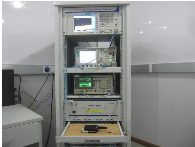
AC power line conducted emission