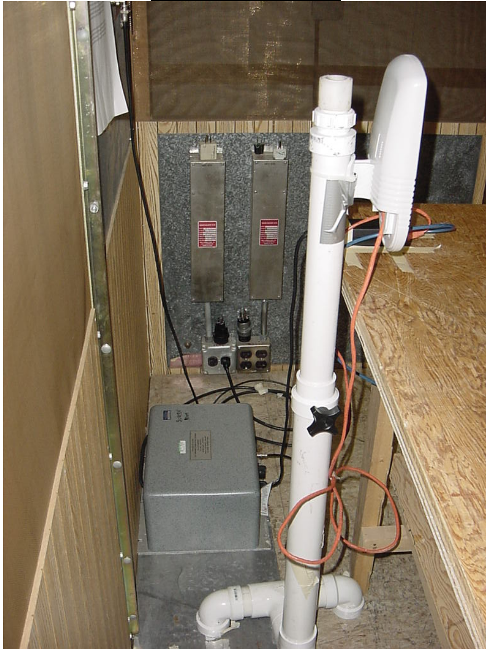
AC Line Conducted - Back

Cambium Networks C024900P021A & C024900P031A 6334