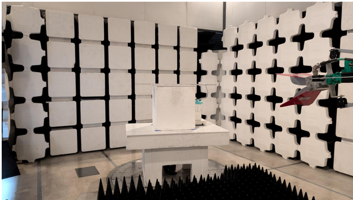
Spurious Emissions Above 1GHz