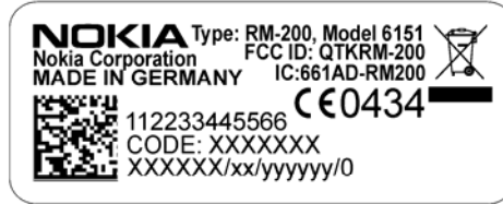
Exhibit 1: Label drawing