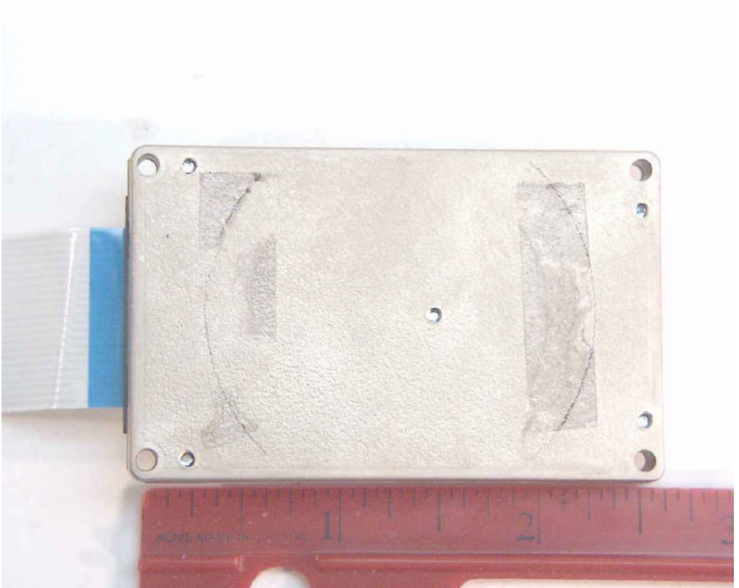
RIM 902M Radio Modem Module, Model R902M-2-O, FCC ID: L6AR902M-2-O

Sur-Gard Security Systems Ltd SG-Sure Signal, Models SURE SIGNAL, SURE SIGNAL MAX & SURE SIGNAL CSR FCC ID: PED-SURESIGNAL