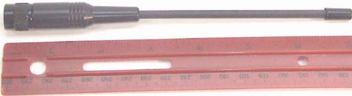
Max Lion Corporation, B-27 T Antenna, Gain = 3 dBi