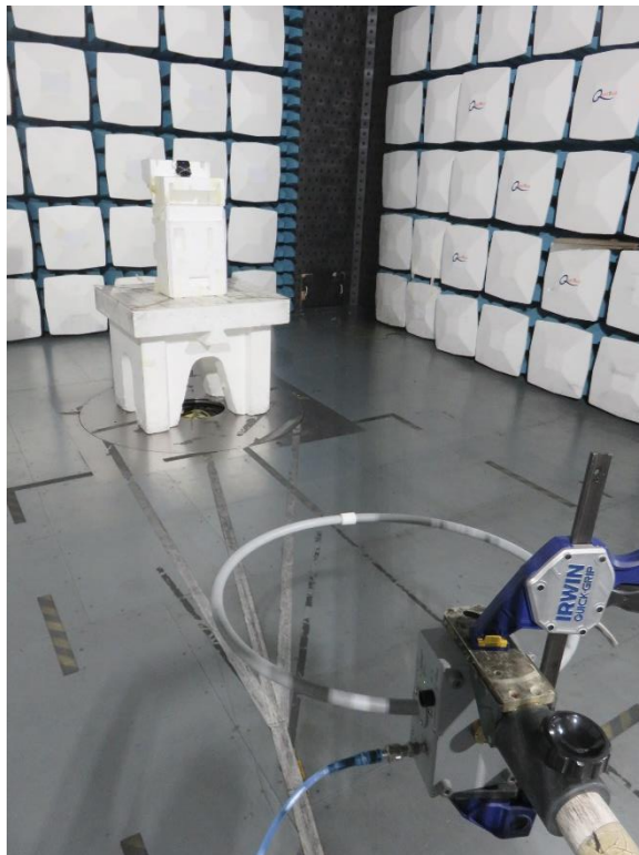
Photograph No.1 Setup for spurious field strength measurements in anechoic chamber from 9 kHz to 30 MHz