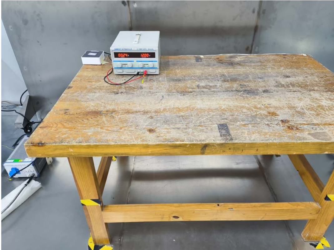
AC Line Conducted Emissions Side Review-Model: UC501-915M