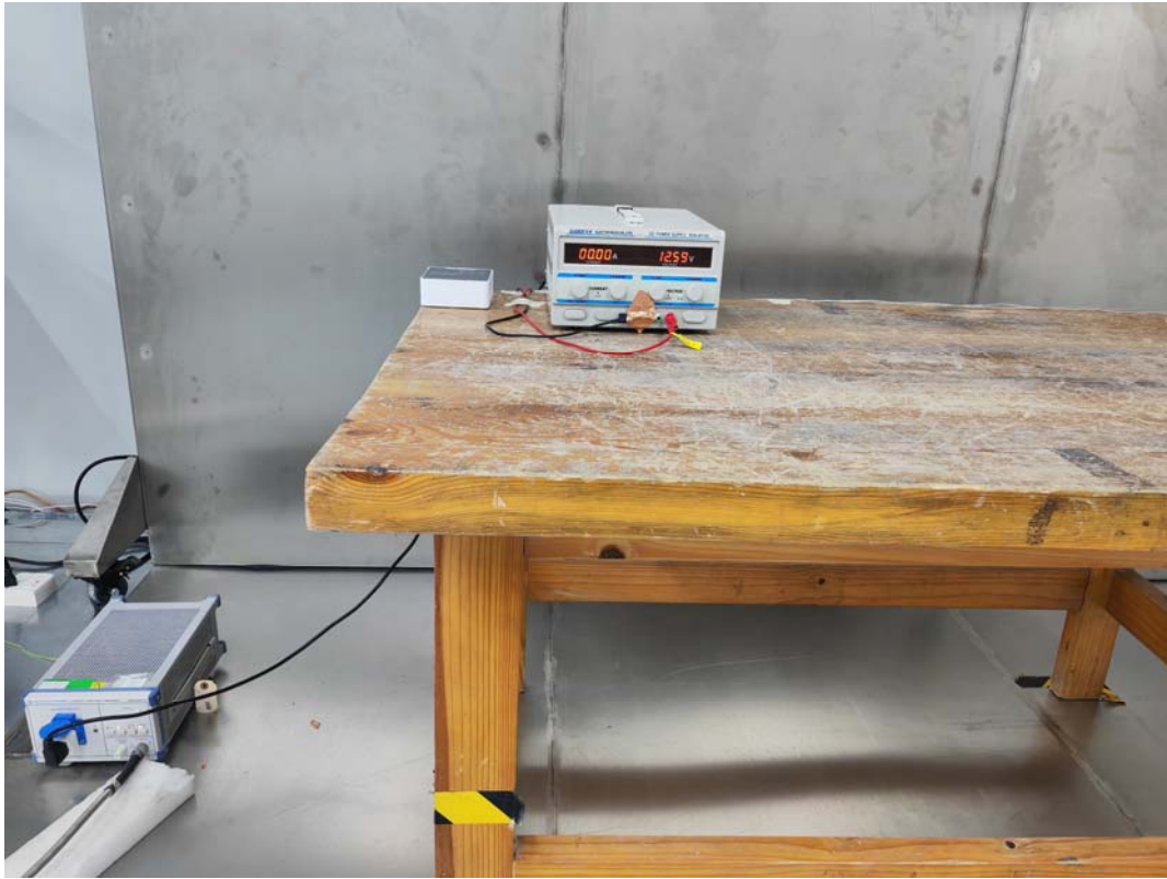
AC Line Conducted Emissions Side Review-Model: UC502-915M