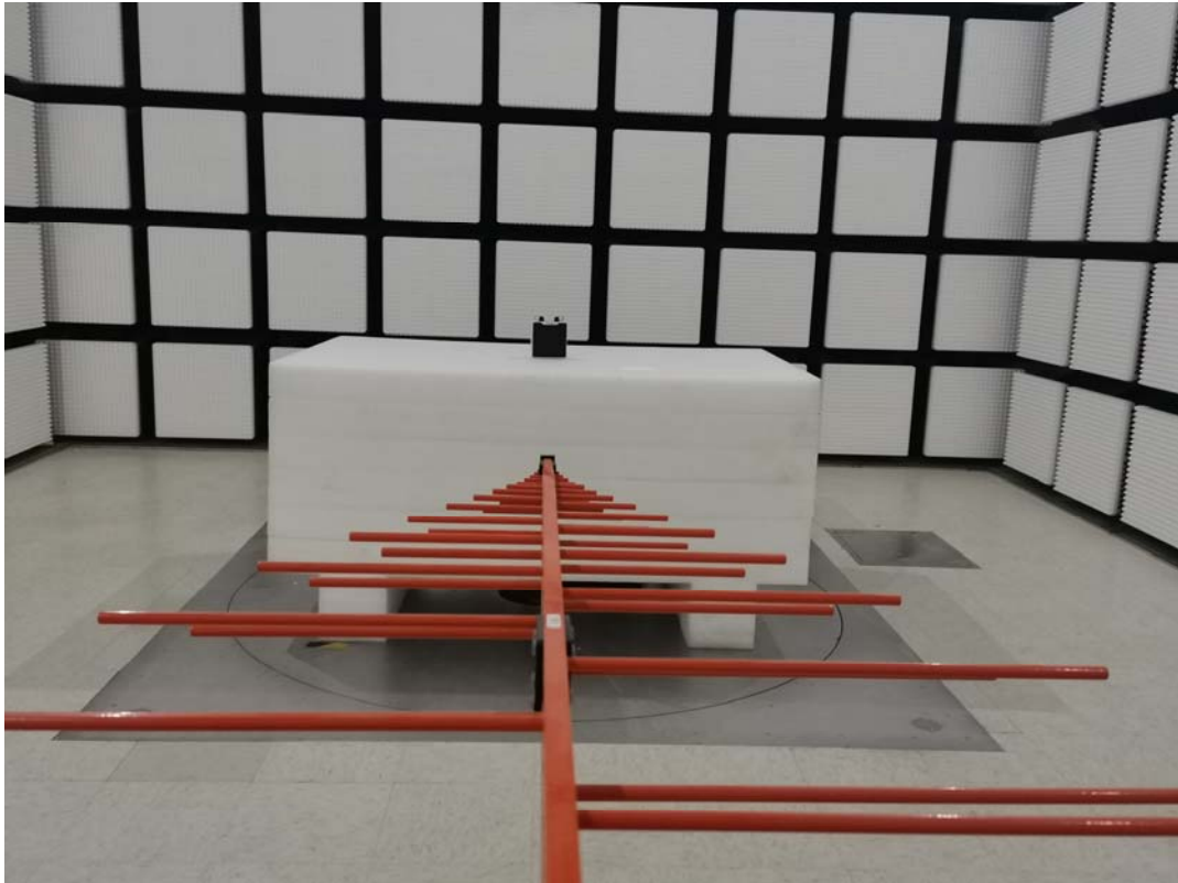
Radiated Emission Below 1GHz-Model: UC502-915M