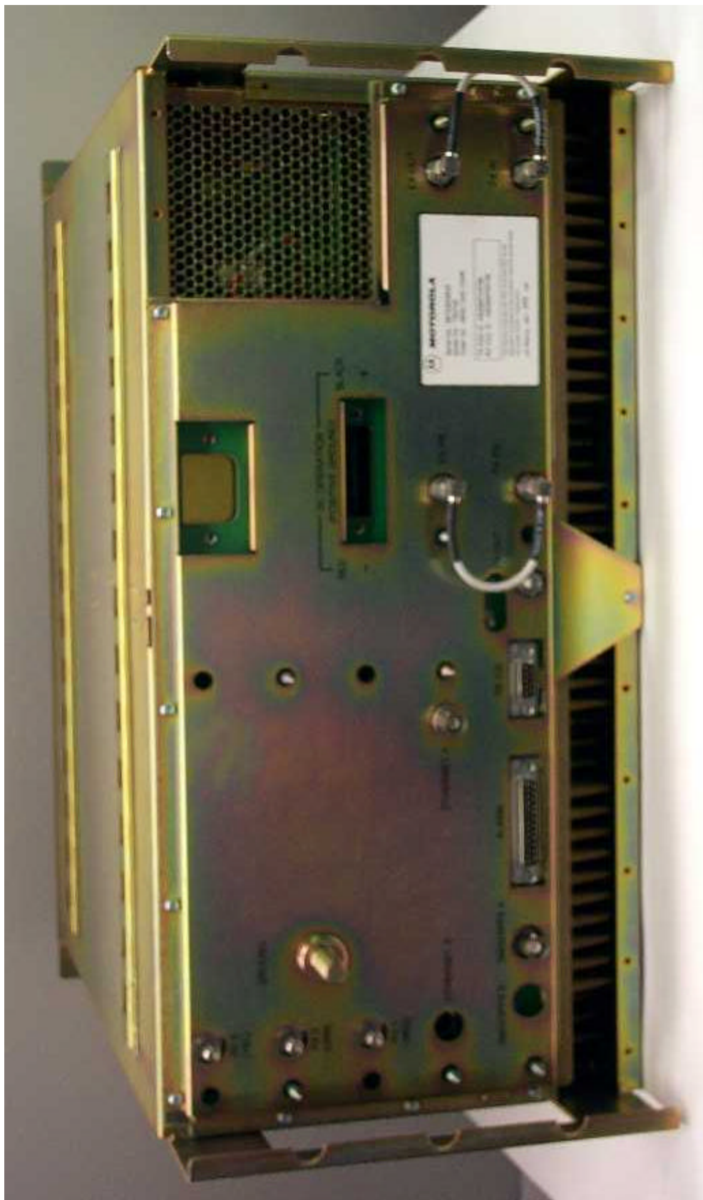
Rear of Station Including Location of the FCC ID Label